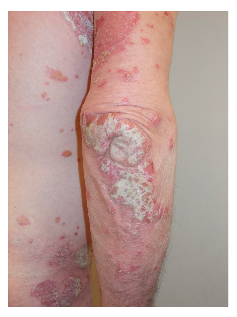
Figure 1. Psoriatic lesions on the elbows.

help to better elucidate the pathogenesis of this disease and identify new targets for a more specific and effective treatment.